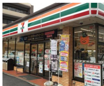
convenience store About a 4-minute walk