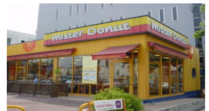
MISTER DONUT About a 5-minute walk