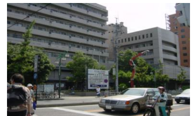
Hospital About a 5-minute walk