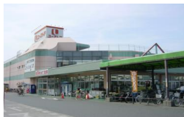
PIAGO About a 5-minute walk